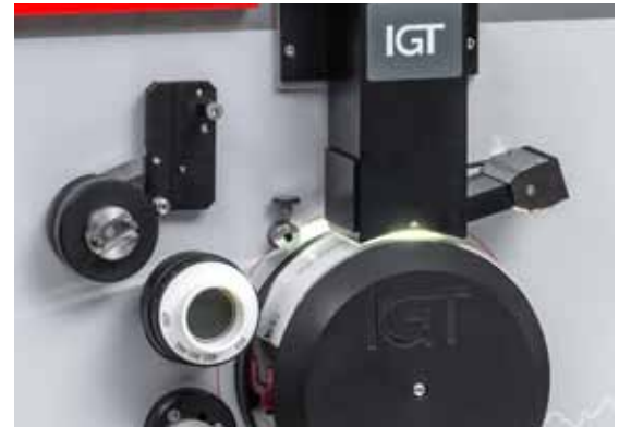
IGT Pick ISO 3783: the camera is scanning

Our software engineers will continue to develop new analysers, and these will then be announced on the website.