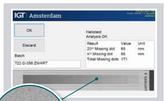
Helio test: the test result