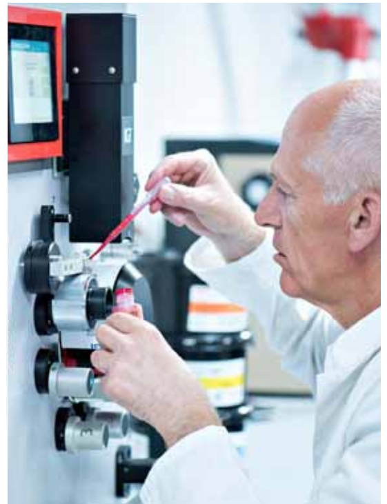
Helio test: execution

The Amsterdam 6 is the ultimate printability tester.