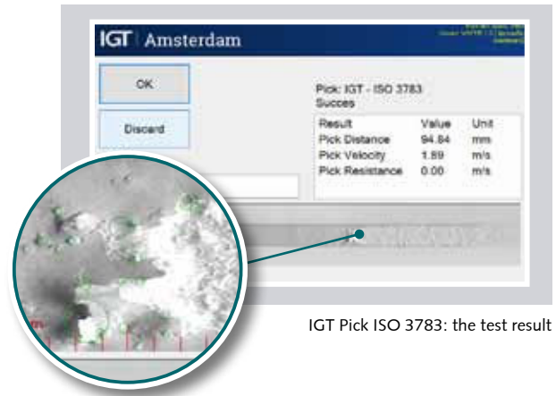
IGT Pick ISO 3783: the test result

Until now algorithms have been developed for the following test methods: Pick – Heliotest – Mottle – Print penetration - IGT Roughness – Hydro-expansivity. An actual overview can be found on the IGT website.