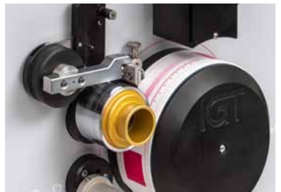
Helio test: print