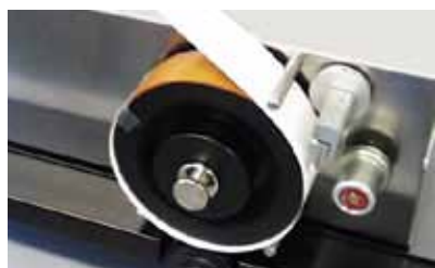
Mounting substrate for gravure

The low cost version is the F1 Basic. In this version the printing speed can be adjusted to 0,3; 0,6 or 0,9 m/s. The anilox/printing force can be set to 20/30, 40/60 or 60/90 N for the type Low and on 100/150, 200/300 or 300/450 N for the type High. The F1 Basic is used when there is no need to change the speed or anilox- and printing force within small limits. This tester is specially used in QC of inks and/or substrates. The type Low is the best choice if only halftone printing forms are used and the type High when only prints in full tone are made.