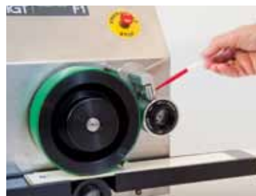
Applying the ink

This tester is a modified F1 to make prints on corrugated board with thickness up to 14 mm so all types of corrugated board can be printed. This is the result of a combination of the diameter of the impression cylinder, the type of printing form and the variable position of the substrate guide.