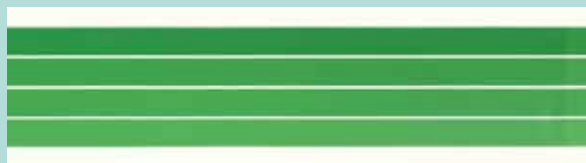
Flexo print of four bands to check the colour in four ink layers