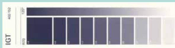
Gravure print to check the colour in ten coverages and/or to check the roughness of the substrate