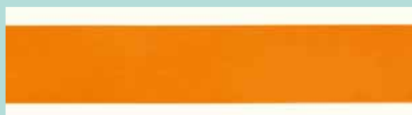
Standard flexo print to test many properties