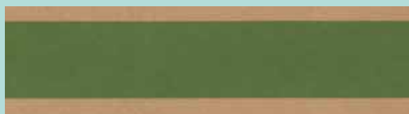
Flexo print on paper board to check colour, coverage and other dry properties